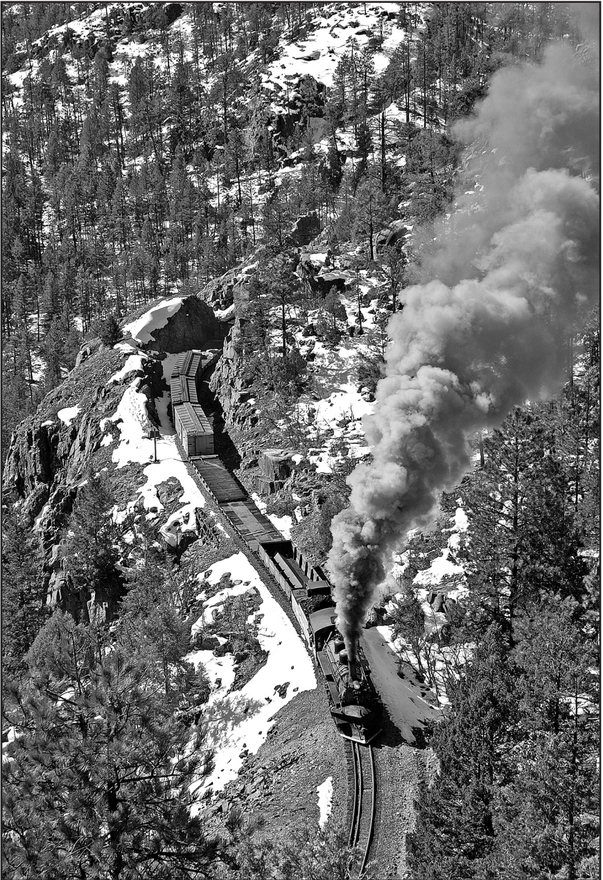
Durango & Silverton Narrow Gauge Railroad engine #473 brings a chartered photo freight through a cut just north of Rockwood, Colorado, on February 24, 2009.