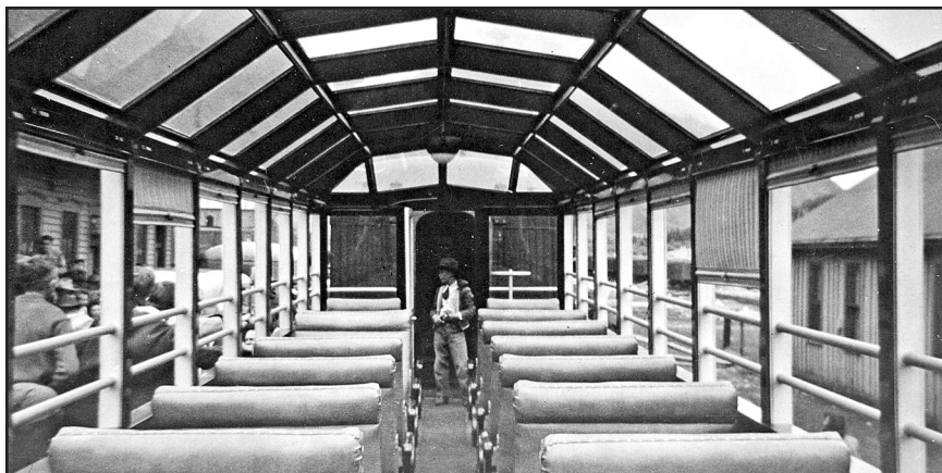
The interior of the Silver Vista observation car is shown in this Sanborn postcard view of the era. This car was destroyed in the car shop fire at Alamosa.

Engine 486 was added at Chama to assist the 14-car train to the summit of Cumbres Pass on the 4% grade. The fall colors were spectacular that year. Our arrival into Alamosa was before dark, so we returned to Denver that night. This was the last trip for the famous “Silver Vista” car as it was destroyed three days later in the Alamosa car shop fire.