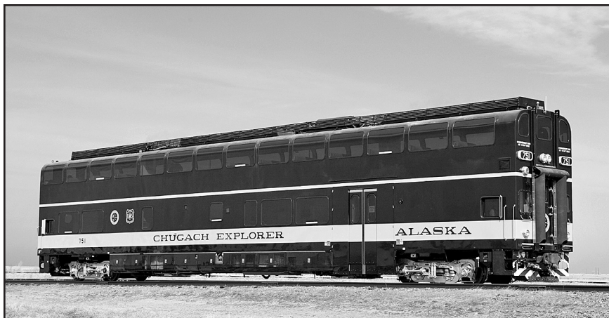
A roster photo of Alaska Railroad DMU #751, the “Chugach Explorer,” on the tracks of the Hudson Terminal Railroad.