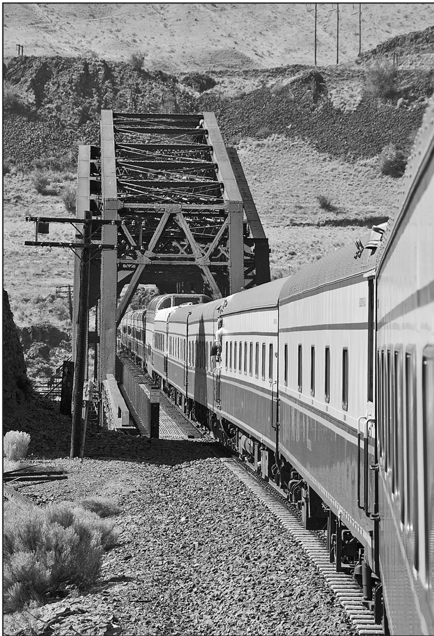
A GrandLuxe Express 20-car train rolled across the Columbia River on BNSF rails near Rock Island, Washington, on August 12, 2008 en route west via Everett, Washington, towards Tacoma.